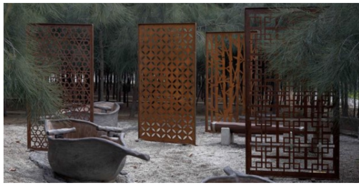
CORTEN SCREEN ALONG PARKING FEATURE IN COBBLE ROCK BASE