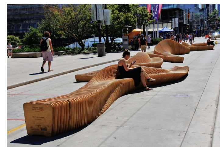
FEATURE SEATING LONG BENCH SEAT FEATURE SET IN CENTRE OF MAIN AMENITY PATIO AREA