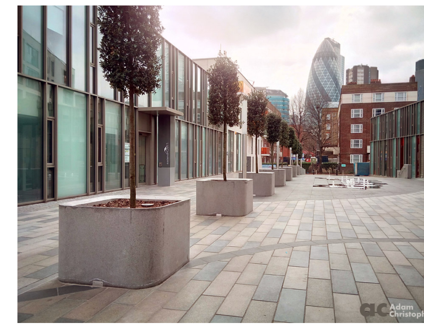
LARGE CIP CONCRETE TREE PLANTERS