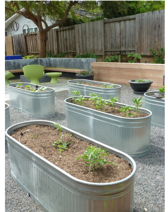
RESIDENT GARDENING CORNER 2' x 2' x 4' & 2' x 2' x 6' ALUMINUM HORSE TROUGH CONTAINERS SET ON CRUSH GRAVEL SURFACE OVER PARKING SLAB CHAIN LINK FENCE SURROUND FOR FALL & DEER PROTECTION