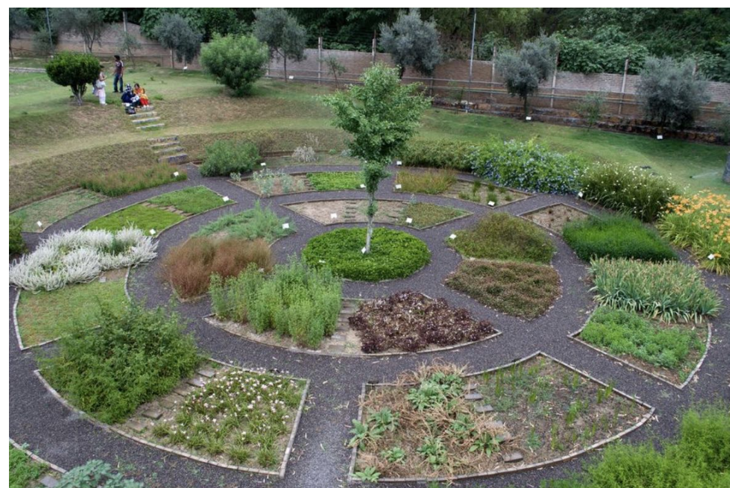
HEALING GARDEN SELECTION OF PERENNIAL HERBS & MEDICINAL PLANTS IN FEATURE FRONT GARDEN, SOME OPEN DIRT PLOT SPACES AVAILABLE FOR RESIDENT GARDENING